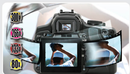
High-speed transfer rates & improved camera response