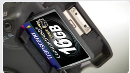
Extra-durable connector for frequent insertion/removal