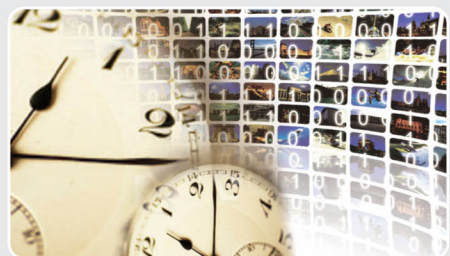
Long life data retention