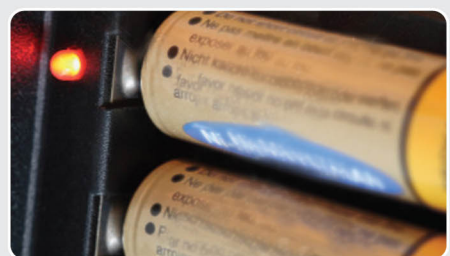
Low power consumption